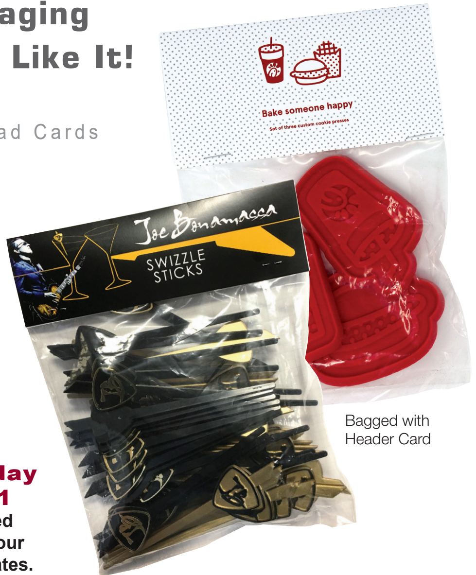
Bagged with Header Card