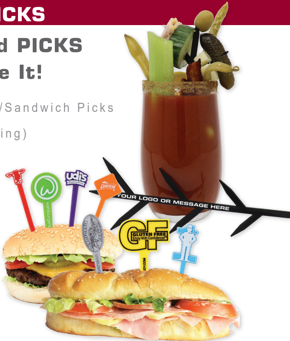
The following picks are examples of custom order designs.