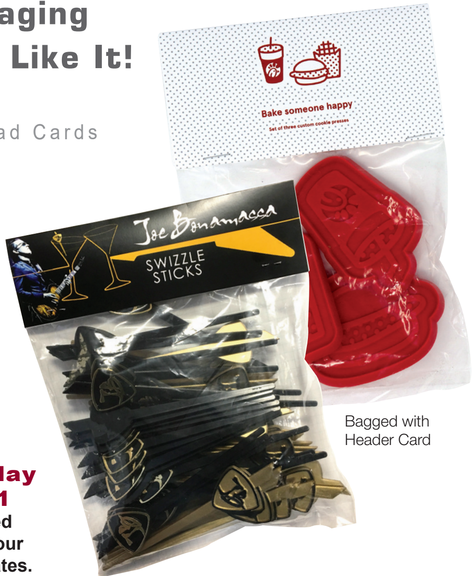
Bagged with Header Card