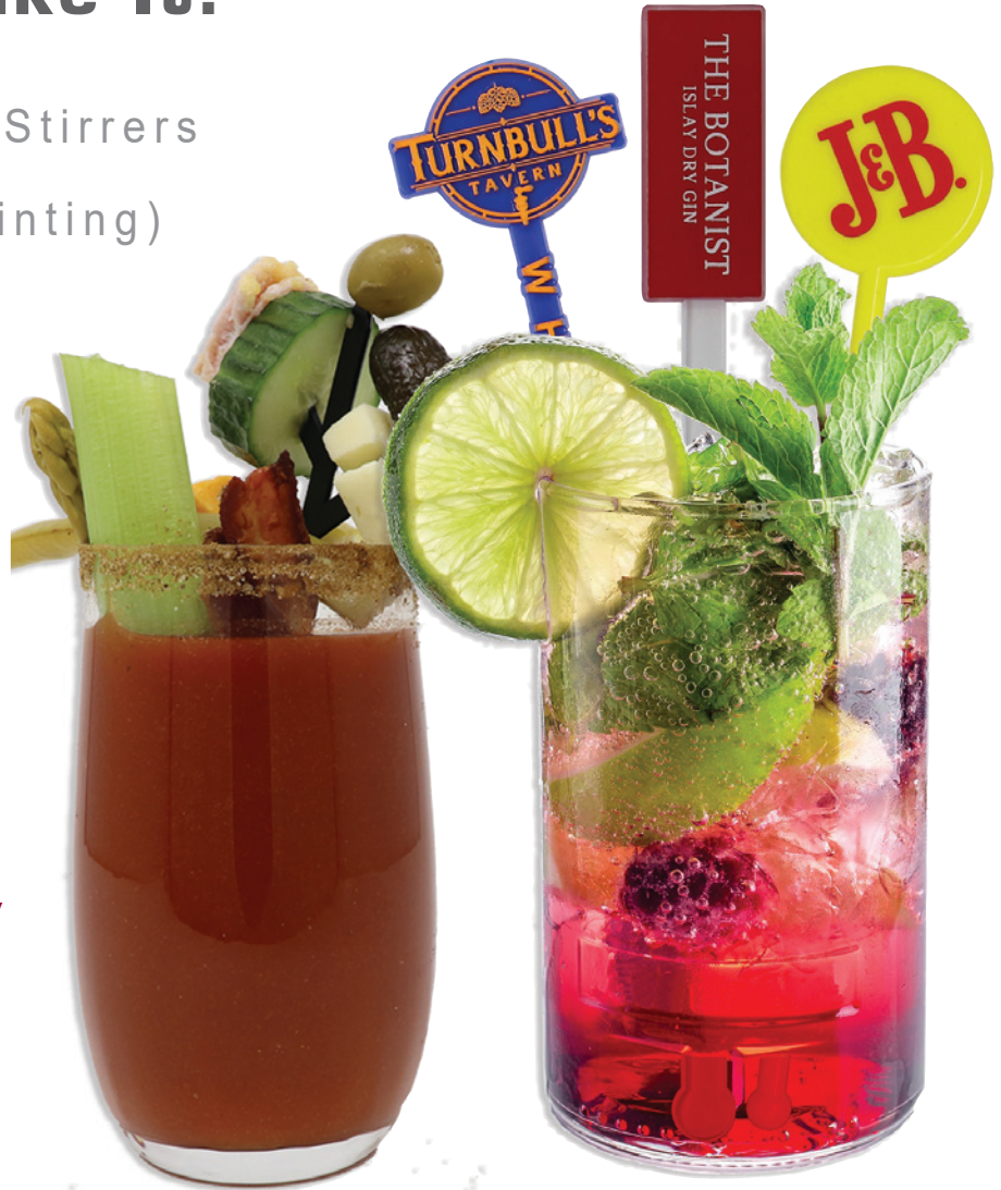
The following stirrers are examples of custom order designs.

Please have the required size, vector art, quantity and color available, and we will get back to you promptly with a custom quotation.