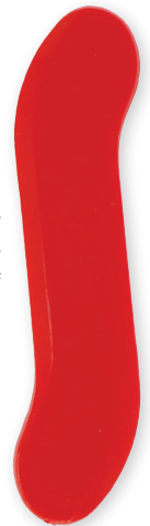
471 4.375 Spatula/ Spreader Option of Embossed Handle (471E)

Visit us today at https://harcoplastics.com/miscellaneous-food-items/