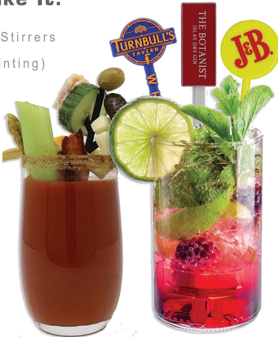
The following stirrers are examples of custom order designs.

Please have the required size, vector art, quantity and color available, and we will get back to you promptly with a custom quotation.